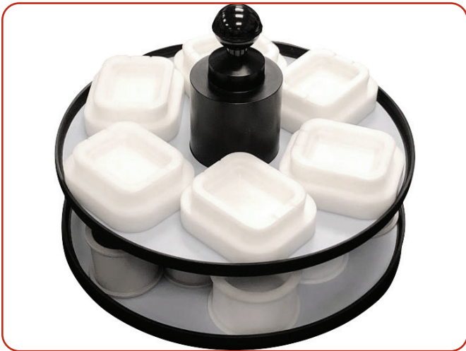
Unique stacking tray design