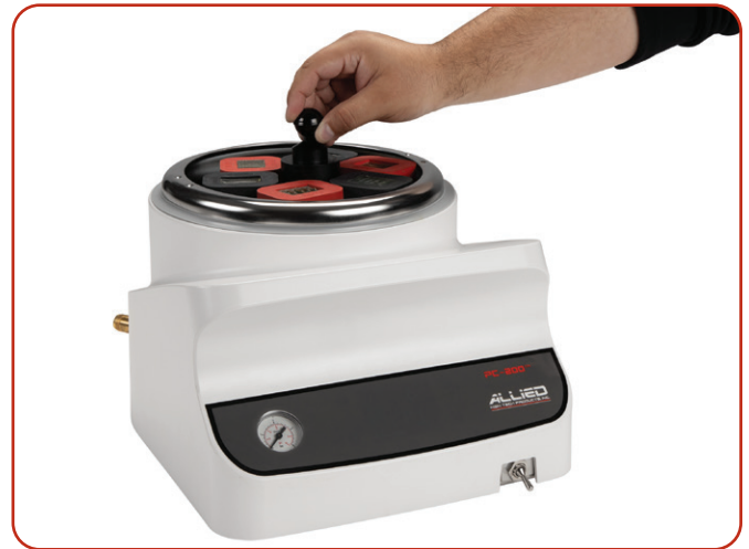
Can fit three (3) stackable trays inside the chamber