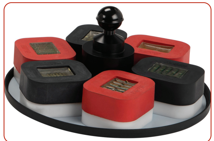
Stacking tray with PTFE lining for easier cleanup