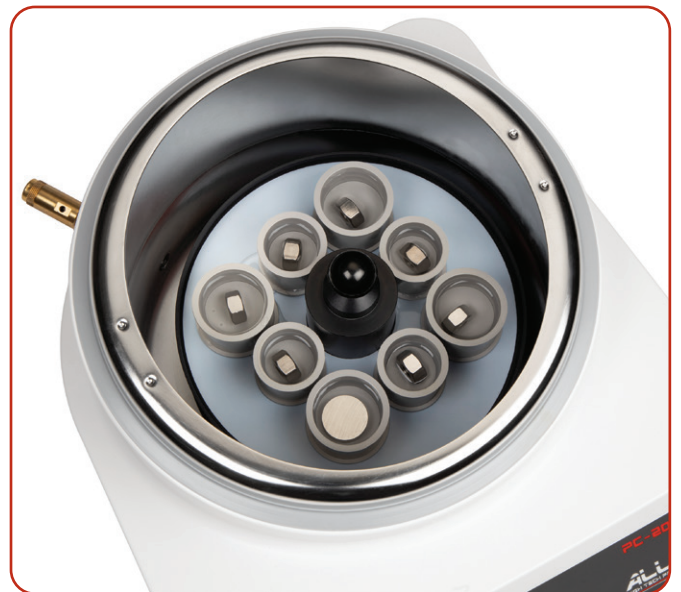
Large chamber accommodates multiple samples