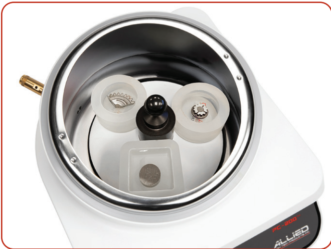
Chamber that easily holds oversized samples